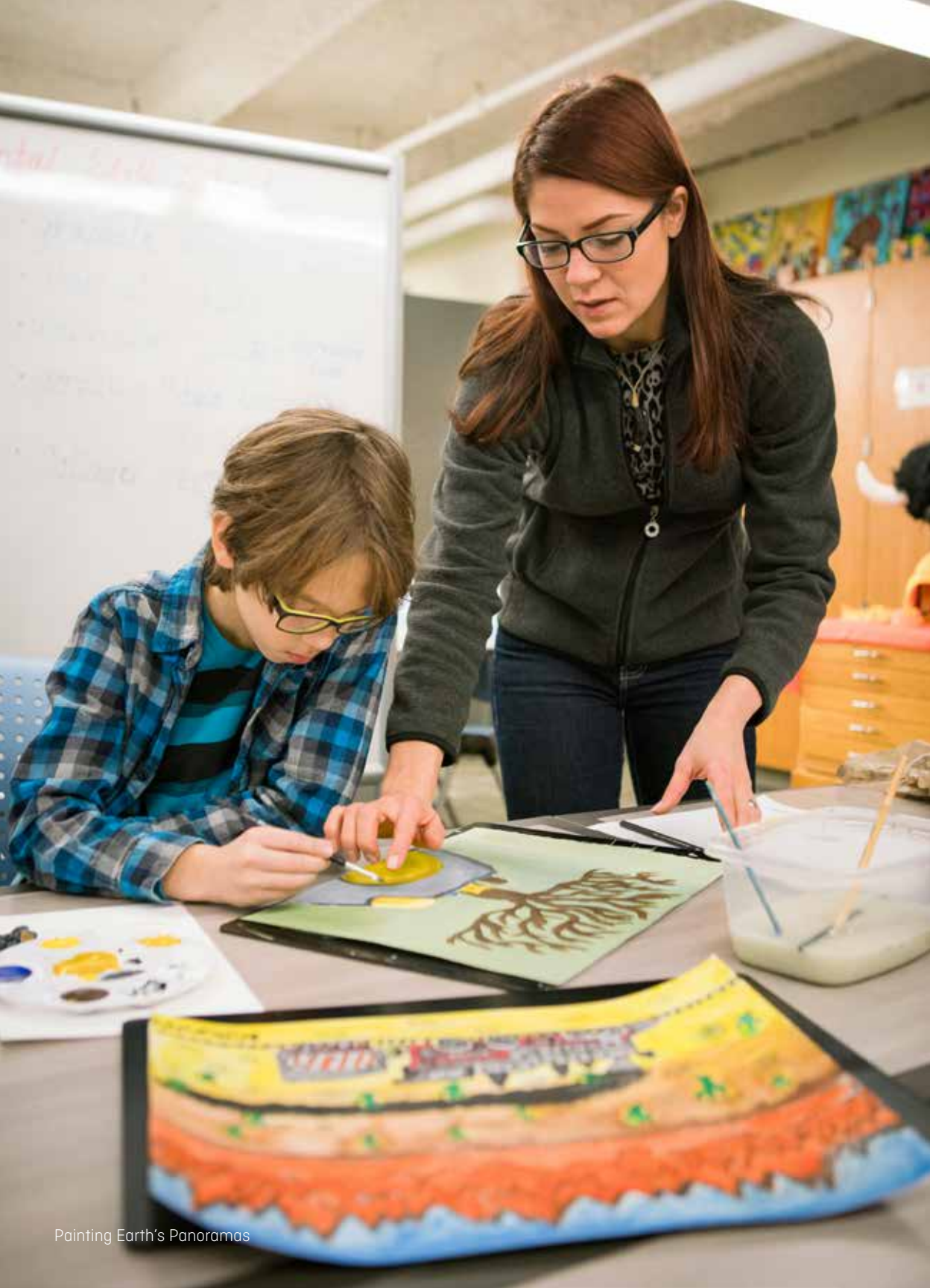
Painting Earth's Panoramas