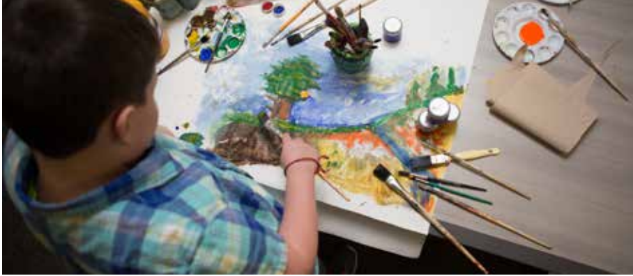
Painting Earth's Panoramas